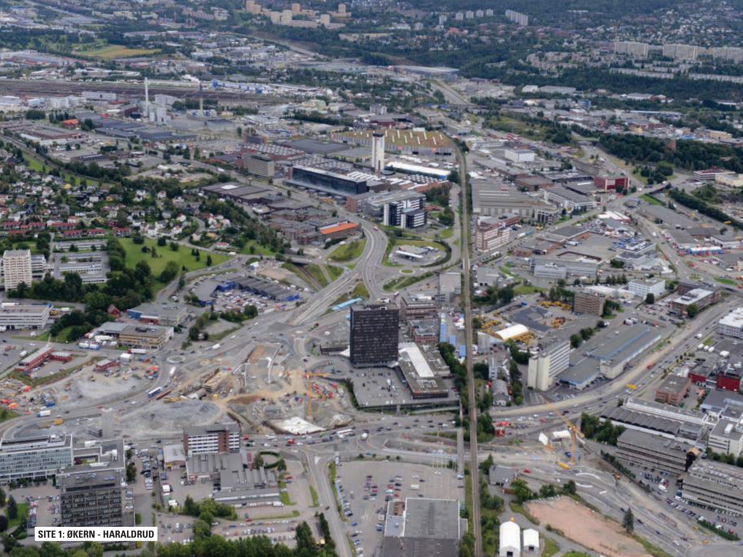
SITE 1: ØKERN - HARALDRUD