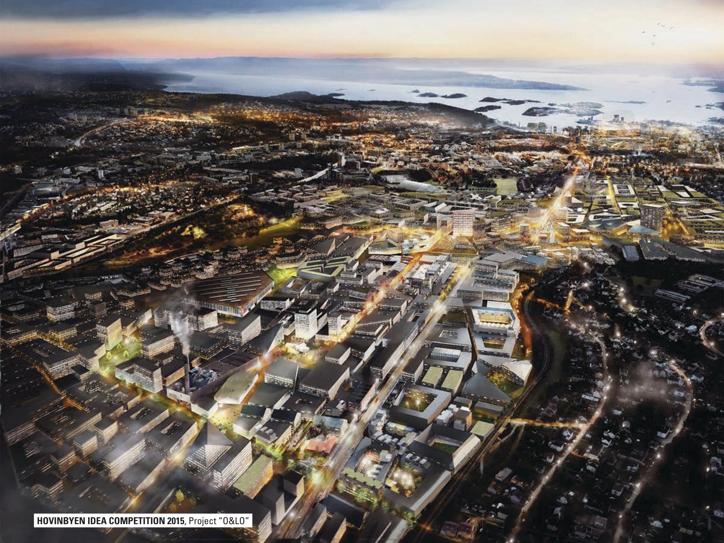
HOVINBYEN IDEA COMPETITION 2015, Project "O&LO"