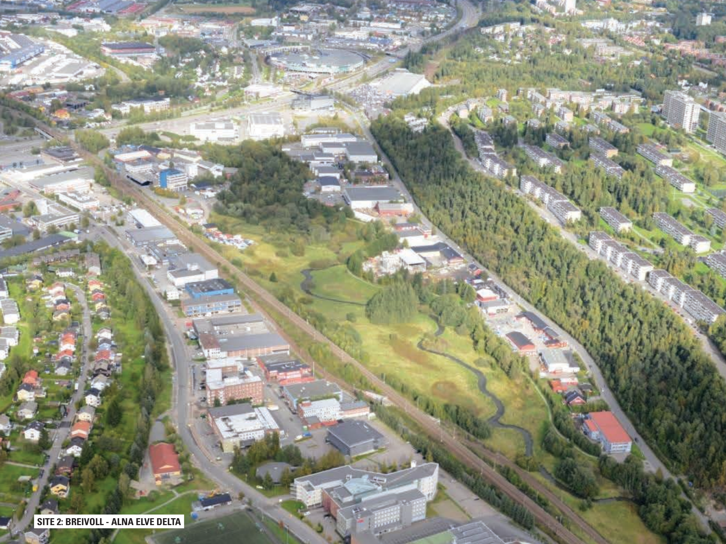
SITE 2: BREIVOLL - ALNA ELVE DELTA