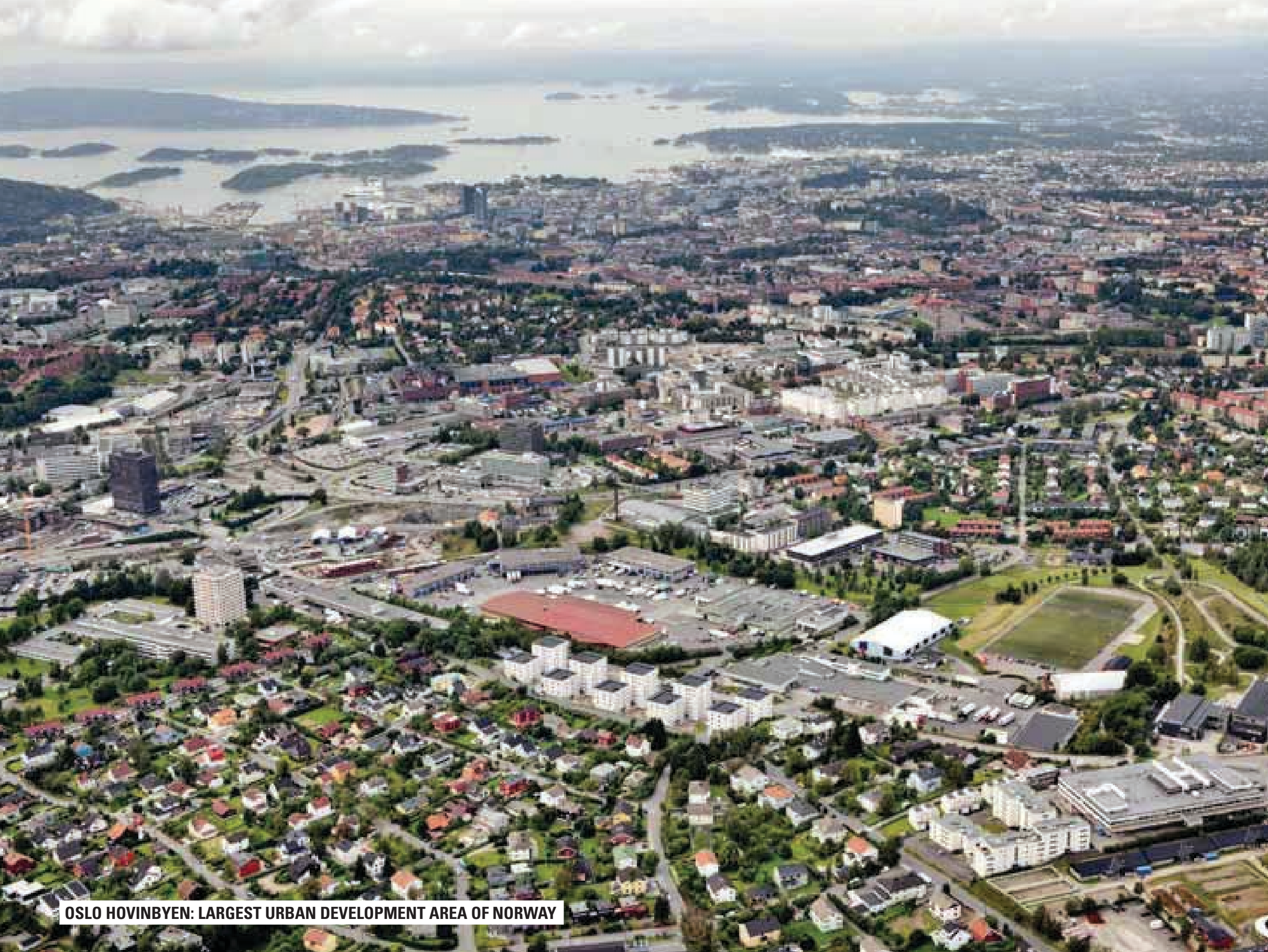
OSLO HOVINBYEN: LARGEST URBAN DEVELOPMENT AREA OF NORWAY